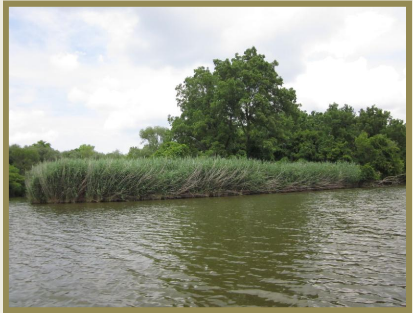
Figure 1 Monkey Island