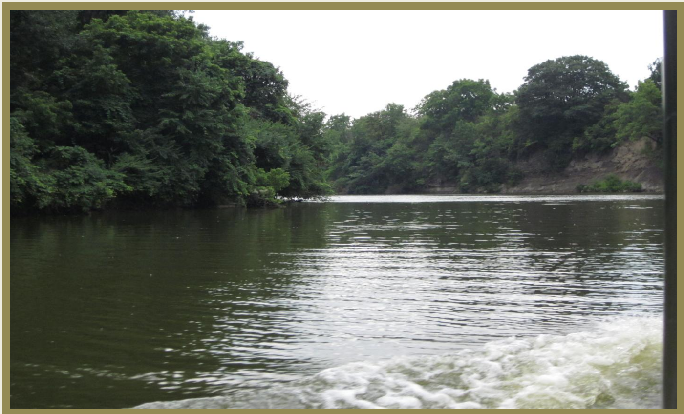
Figure 2 Picture taken during 2010 Boat Tour of the Black River courtesy of Lorain Port Authority.

It is our river. It is our responsibility.